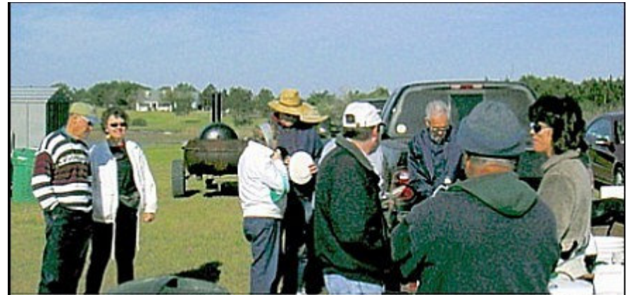
"The Crew" and the first of countless hundreds (dozens?) waiting for the grille (and weather) to warm up.

rent! Something to think about as EAA 534 approaches the crossroads upcoming. & EAA 534 elections, too, are upcoming and we will need a nearly full slate of officers as most EAA 534 officers have determined that it's time for a rest and for some new blood to take on the mantle of creativity and responsibility. These are not time consuming jobs nor do they require any special talents save for a willingness to bring some new ideas to the fore. Won't you help?