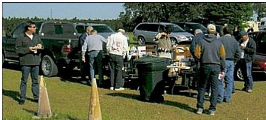
The EAA 534 crew hard at work (?) and some of the earlier of the myriad well-satisfied customers

MAY- EAA 534 will try to hold another Pancake Breakfast at Mid-Florida Airport at Eustis. Details to be finalized.